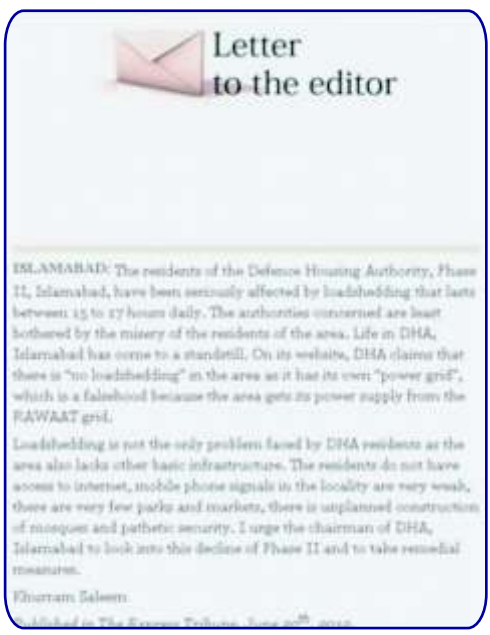
The Express Tribune<sup>27</sup>

Letters to the Editor are the conventional and oldest type of citizen input into journalism. Almost every newspaper and magazine has this section, which enables the ordinary citizen to respond or give feedback to any news, editorial, or article, which might have appeared in the newspaper. Many citizens who write letters to the editor can develop into actual citizen journalists.<sup>26</sup>