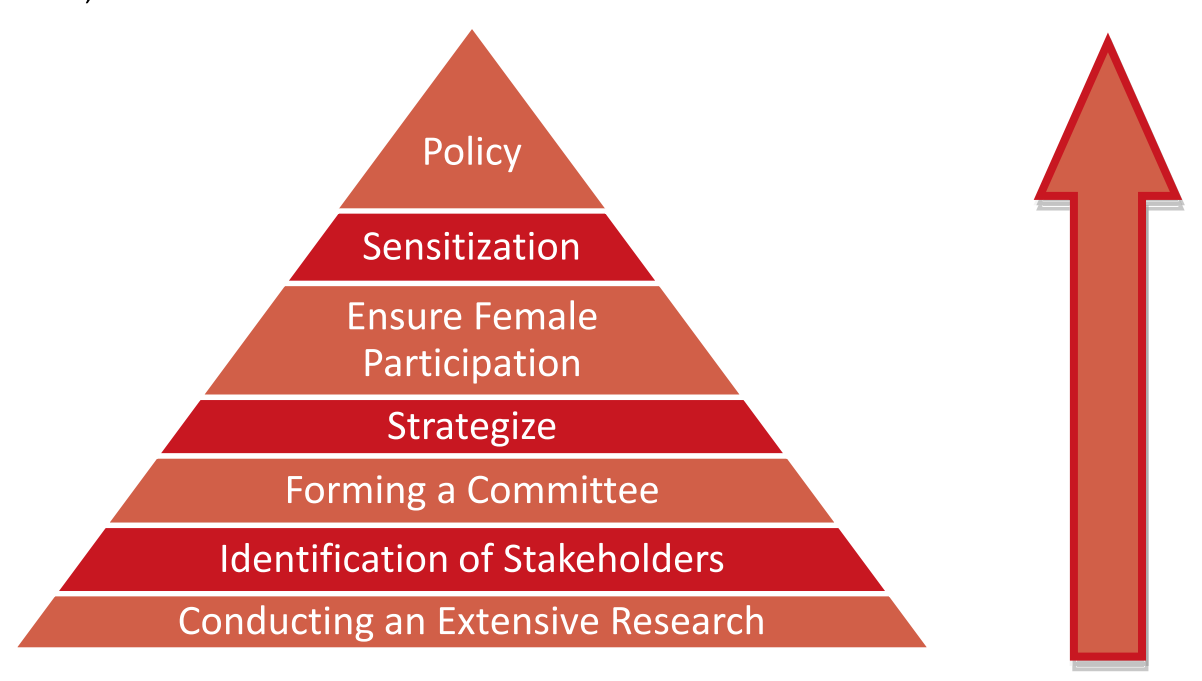
Step 1: The participants are briefed by the facilitator on the following process displayed on board;